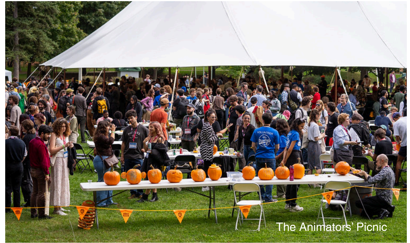
The Animators' Picnic