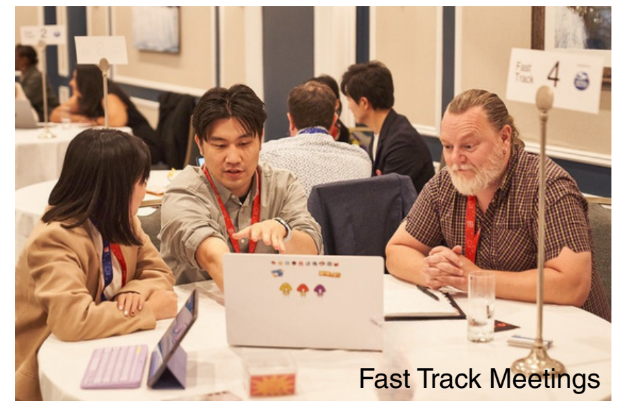
Fast Track Meetings