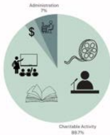
CFI Expenses '22/'23